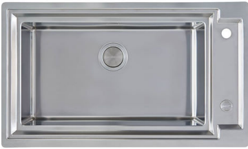
OUTLINE H25 6625 000