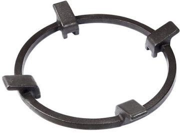
Cast iron wok support 9601 727